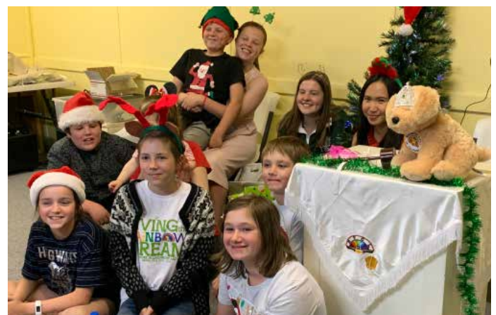
The Rainbow Girls Christmas meeting at which items were donated to Puddle Jumpers.

Rainbow Girls Community Service projects include supporting the Puddle Jumpers, "a non-profit, non-government organisation responding to the social development needs of society's most vulnerable children and young people. We believe all kids matter and deserve the right to engage in happy and fun experiences in their life." They are currently raising funds for the Worthy Advisor's service project for Parkinson's Australia..